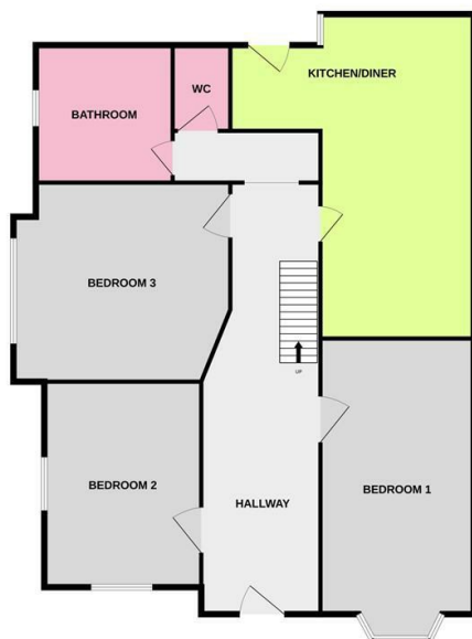
GROUND FLOOR 2123 sq.ft. (197.2 sq.m.) approx.